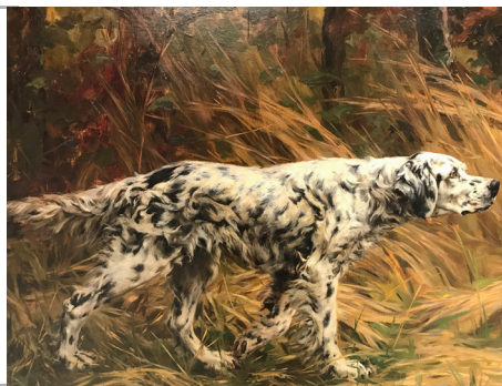
AKC is the acronym for American Kennel Club. A kennel is a structure or shelter for dogs.