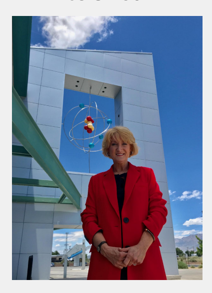
Season 3 is officially launching on Public Television/PBS stations nationwide in May! Here's a sneak peek.